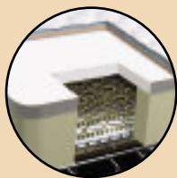
FOAM ENCASED SYSTEM