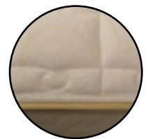
TWO-TONE DAMASK COVER FABRIC