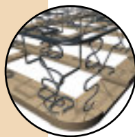
ULTRASTEEL™ BOX SPRING