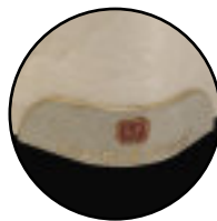
PEARLIZED METAL CORNER GUARDS