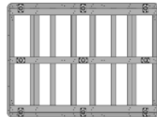
Recommended support locations

If using glides (legs), install at the nine points shown above.